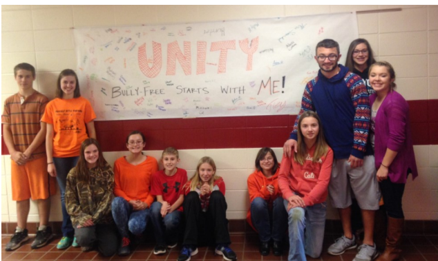
Following the presentation, all students and staff signed a poster stating: "Unity, Bully-free starts with ME." By signing the poster, students and staff agree to take a stand against bullying