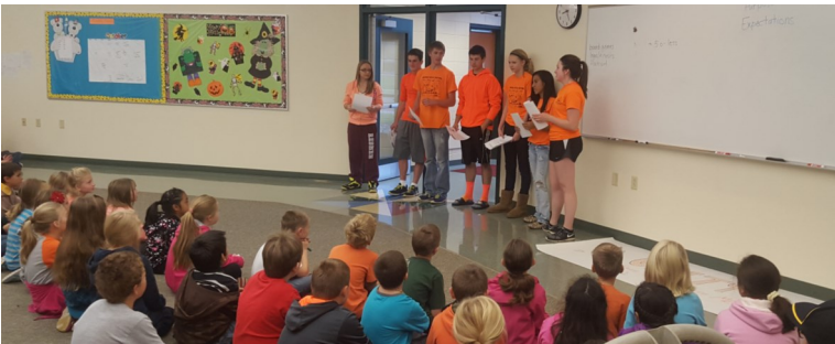
Wednesday, Rib Lake High School students presented to elementary and middle school students about bullying prevention

BULLYING WAS ONCE CONSIDERED A SIMPLE, HARMLESS RITE OF CHILDHOOD EXPERIENCED BY MANY STUDENTS. TODAY, RESEARCH SHOWS THAT BULLYING HAS SIGNIFICANT SHORT AND LONG-TERM EFFECTS THAT IMPACT EDUCATION, HEALTH AND SAFETY. TAKE A STAND AGAINST BULLYING!